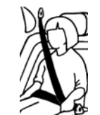
Lap and Shoulder Belt