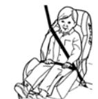
High Back Belt Positioning Booster