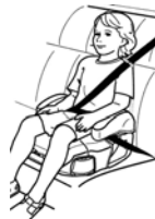
Backless Belt Positioning Booster